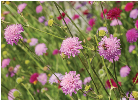
Knautia macedonica 'Melton Pastels'