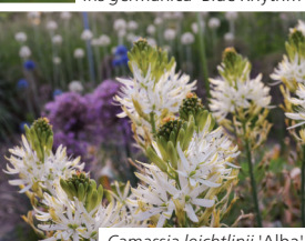
Camassia leichtlinii 'Alba'