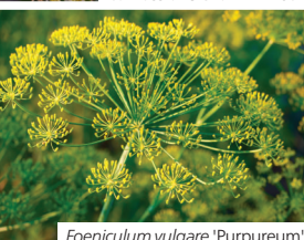
Foeniculum vulgare 'Purpureum'