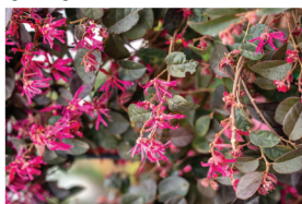
Loropetalum chinense 'Black Pearl'