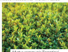
Myrtus communis 'Tarentina'