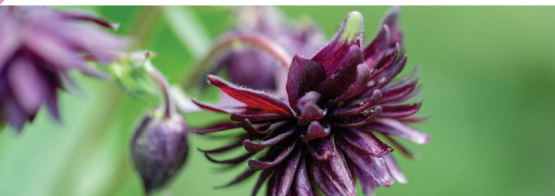
Aquilegia vulgaris var. stellata 'Black Barlow'