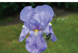
Iris germanica 'Blue Rhythm'